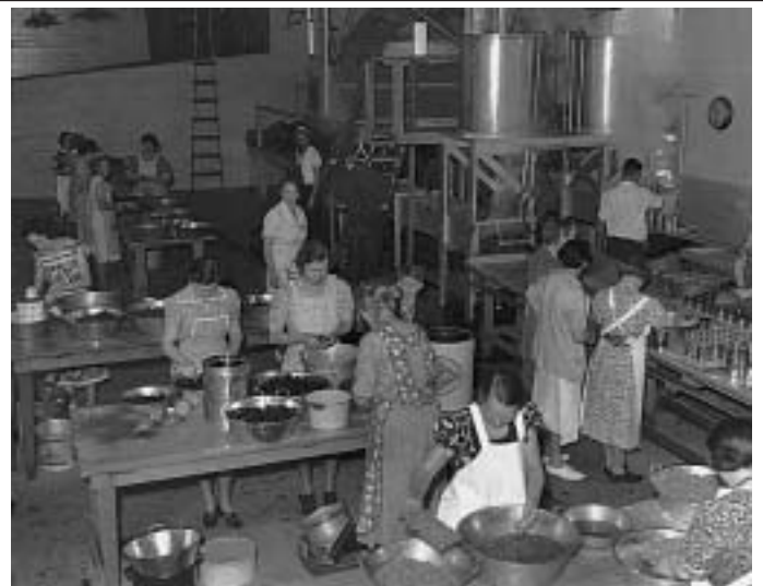
Kirkland Cannery, probably during WWII