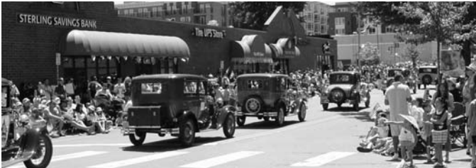
The Evergreen Model A Club brought nine cars for the 2011, 4th of July Kirkland Parade

Kirkland may be 80,000 strong today and have big city challenges but come July 4, Kirkland is a hometown again.