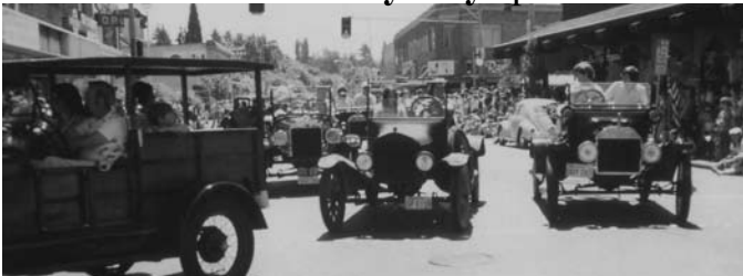
1973 parade during the Moss Bay Days