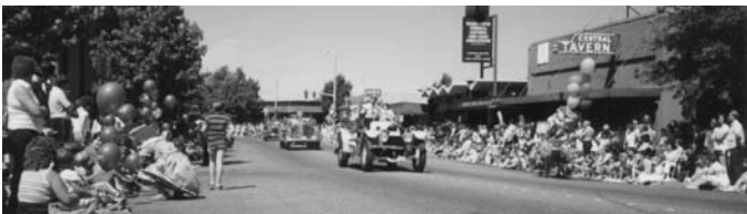
during the 1985 Moss Bay Days parade