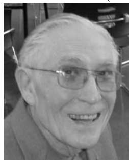
Kirkland High School Alumni