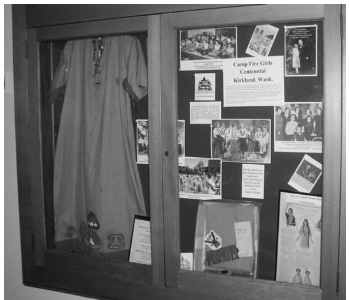
Camp Fire Girls display at City Hall