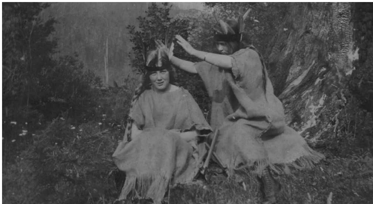
Newspaper clipping from The Seattle Times . The Boy Scouts joined the Camp Fire Girls when presenting Hiawatha.