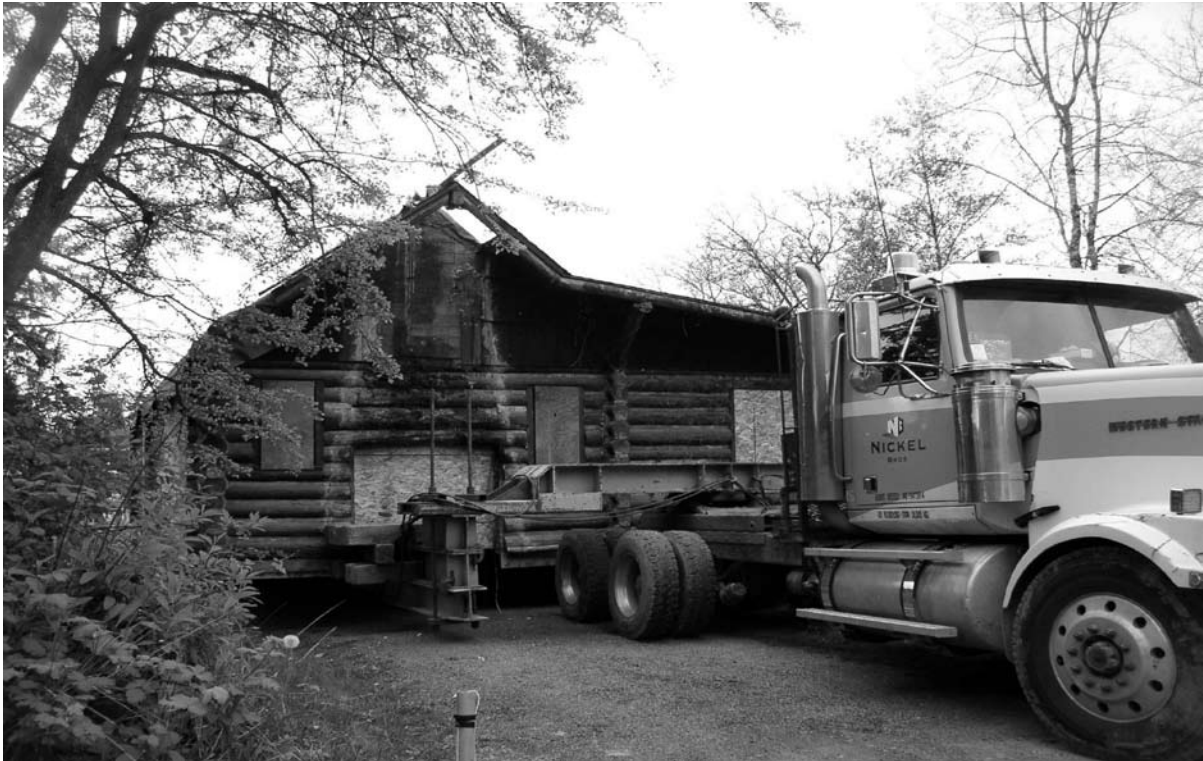
Morning of April 27, 2013. The cabin had been loaded and pulled up to Market Street where it waited until 1:00 a.m..

Blackberry Preserves is produced by the Kirkland Heritage Society , for KHS members and those interested in Kirkland's past. Loita Hawkinson, Editor. For information on KHS - visit our website: www.kirklandheritage.org , or call 425 827-3446 to leave a message.