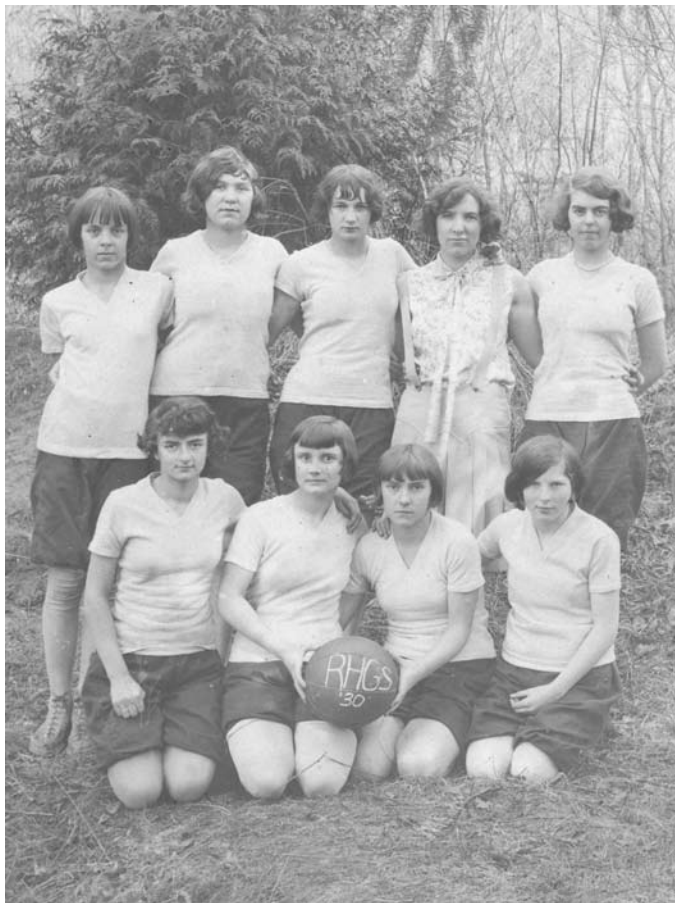
This photo is of the 1930 Rose Hill Girls Basketball Team. Any help you can give naming these girls would be so appreciated.