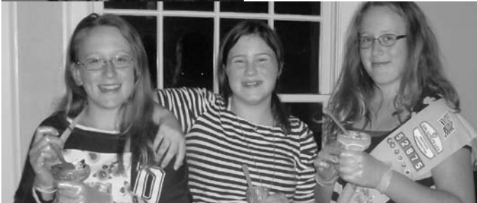
These girls are growing up. This was the third year the Girl Scouts have served the sundaes.