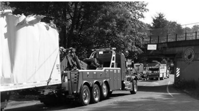
History repeating itself on Kirkland Way: c1950 - 2013