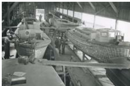
Kirkland's Picket Patrol Boat boatyard

Between Kirkland and Houghton they built a small boat yard that made plywood patrol boats, they were about 36 to 40 feet. The yard was called Ballinger's Boat Works. As you can see Kirkland was getting to be quite a busy little metropolis.