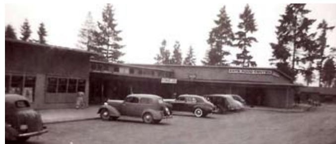
Stewart Height's business district

Kirkland was quite an active place during the Second World War and I was happy to have been a part of those times.