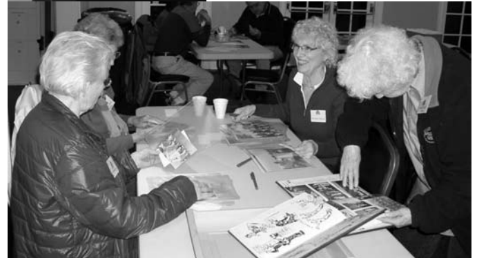
February - Photo Night