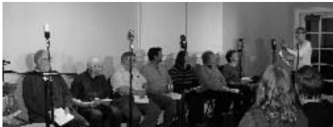
The REPS actors.