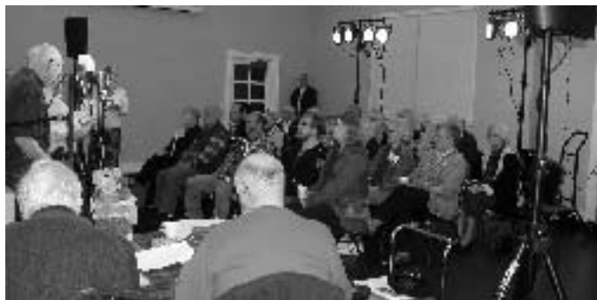
The Radio Enthusiasts of Puget Sound did their best to scare us silly for Halloween.