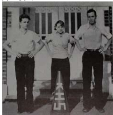
1935 Yell Team