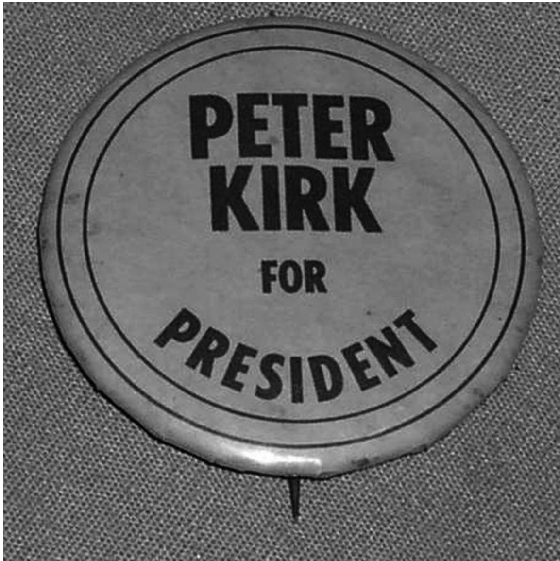
Button from the 1972 Founders Centennial Celebration

The celebration was such a success that the Moss Bay Celebration followed in 1973