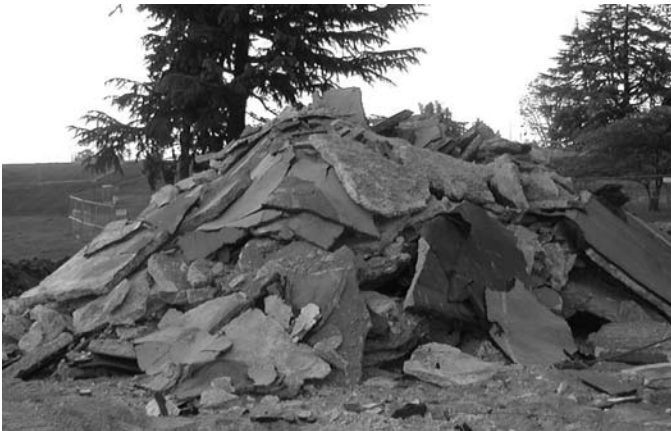
The following day, they were rubble.