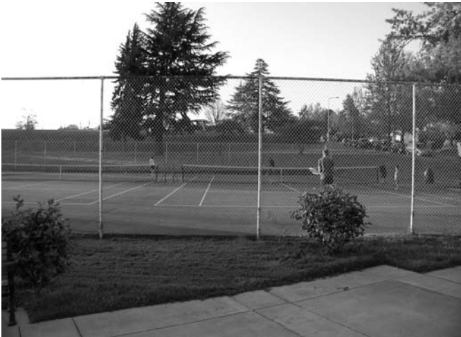
In 2007, these players did not know they would be the last to enjoy Kirkland's depression era tennis court.