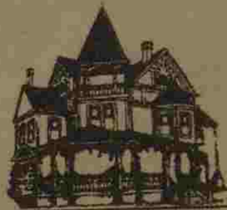
Kirkland Heritage Society