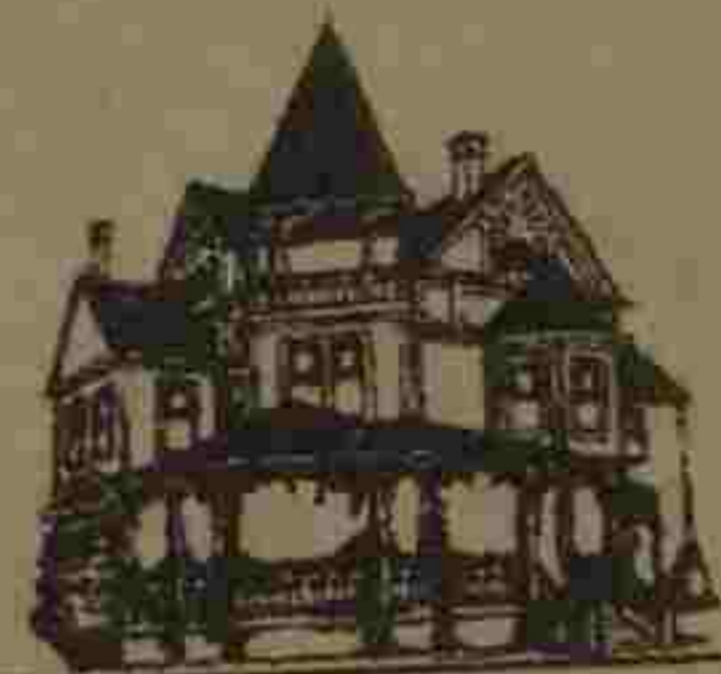
Kirkland Heritage Society