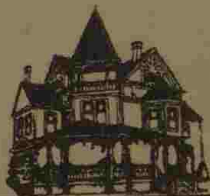
Kirkland Heritage Society