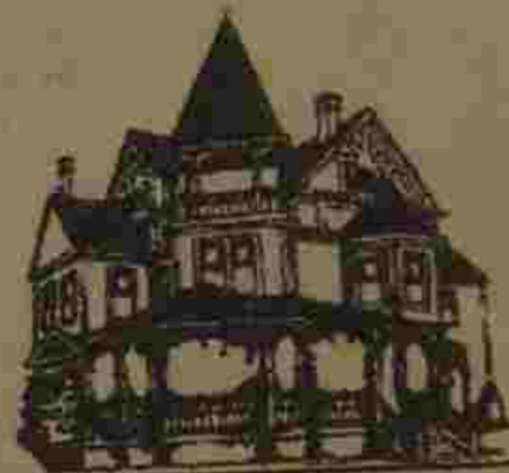
Kirkland Heritage Society