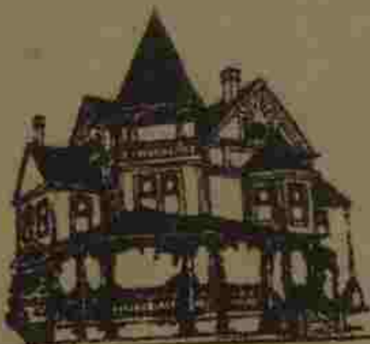
Kirkland Heritage Society