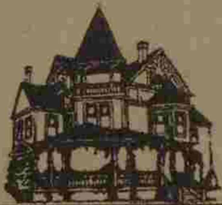
Kirkland Heritage Society