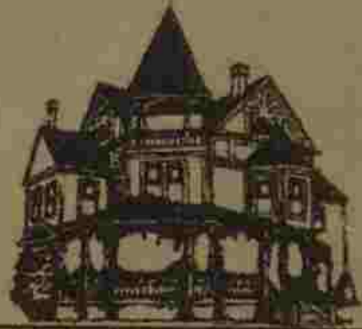
Kirkland Heritage Society