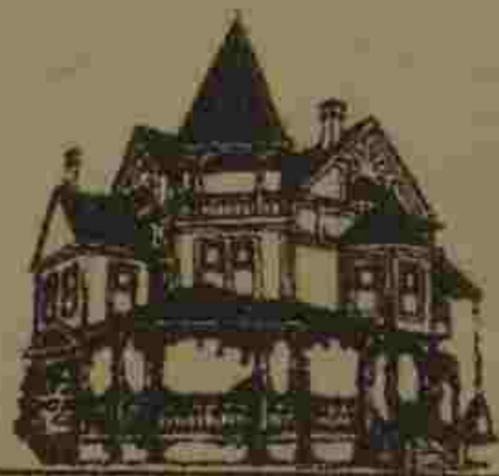
Kirkland Heritage Society