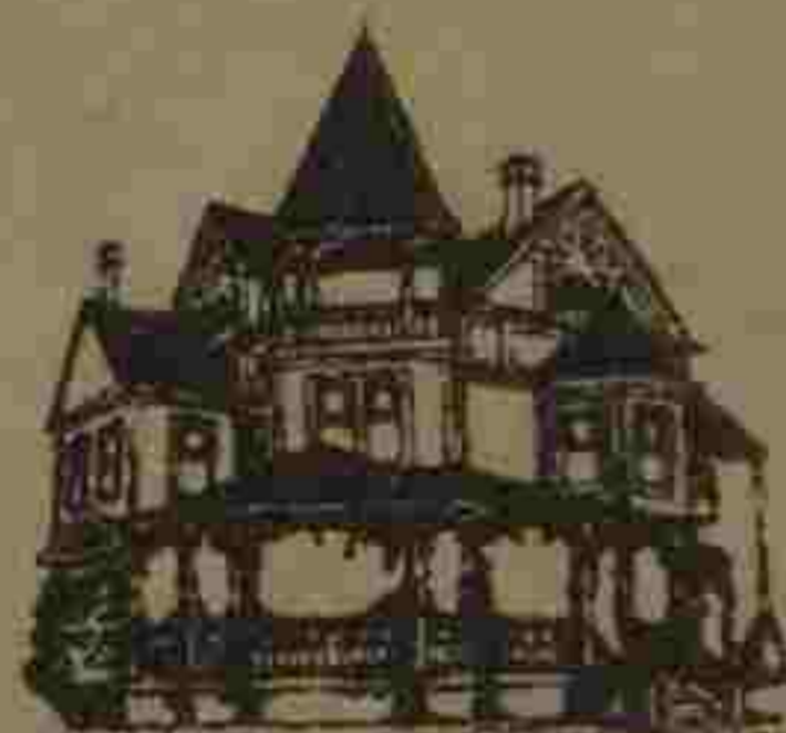
Kirkland Heritage Society

All day on the tussle putting in timbers