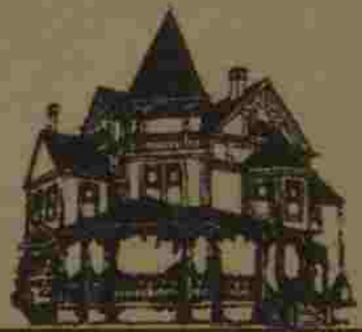
Kirkland Heritage Society