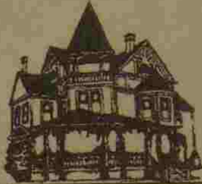
Kirkland Heritage Society

[Faint, illegible handwritten text, possibly bleed-through from the reverse side of the page.]