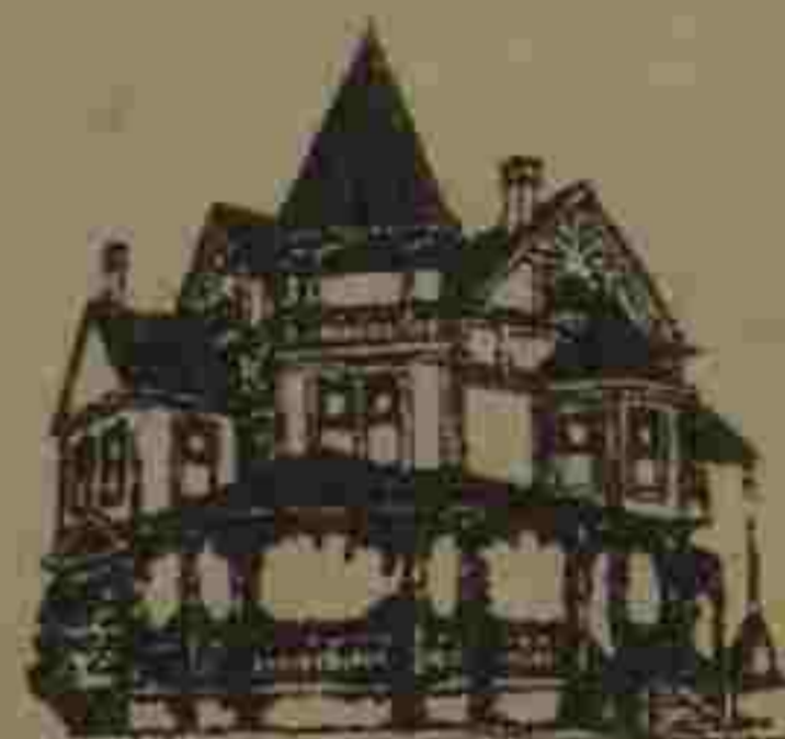
Kirkland Heritage Society

I went to town; called on Penfield's folks.