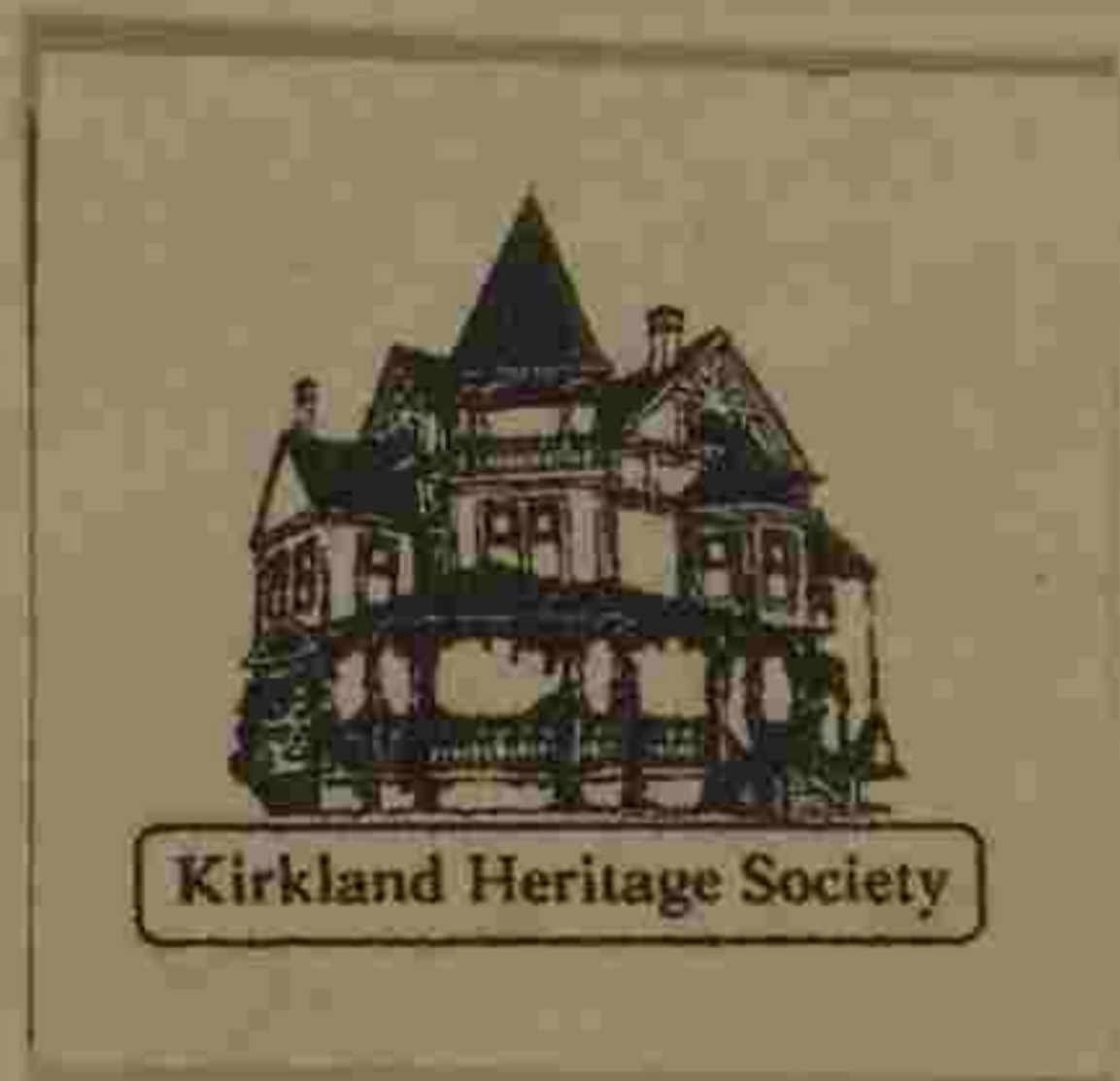
Kirkland Heritage Society

[Faint, illegible handwritten text in cursive script, likely bleed-through from the reverse side.]