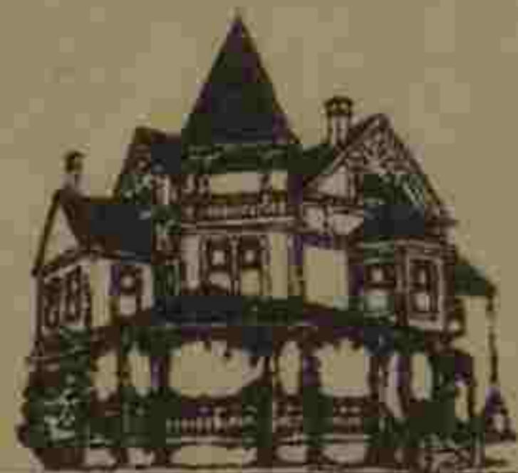
Kirkland Heritage Society