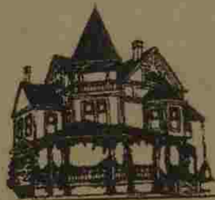
Kirkland Heritage Society