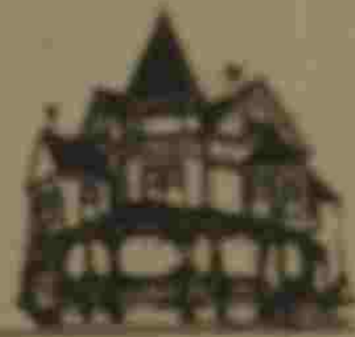
Kirkland Heritage Society