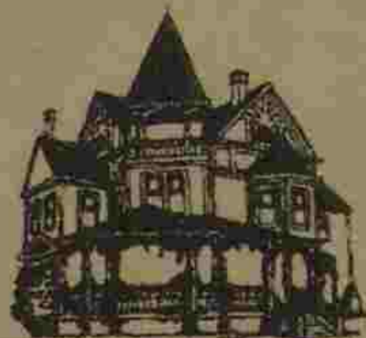
Kirkland Heritage Society