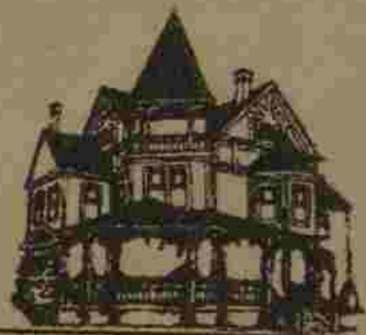
Kirkland Heritage Society