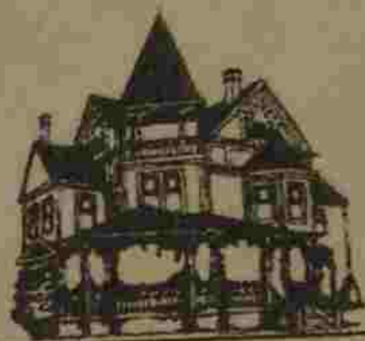
Kirkland Heritage Society