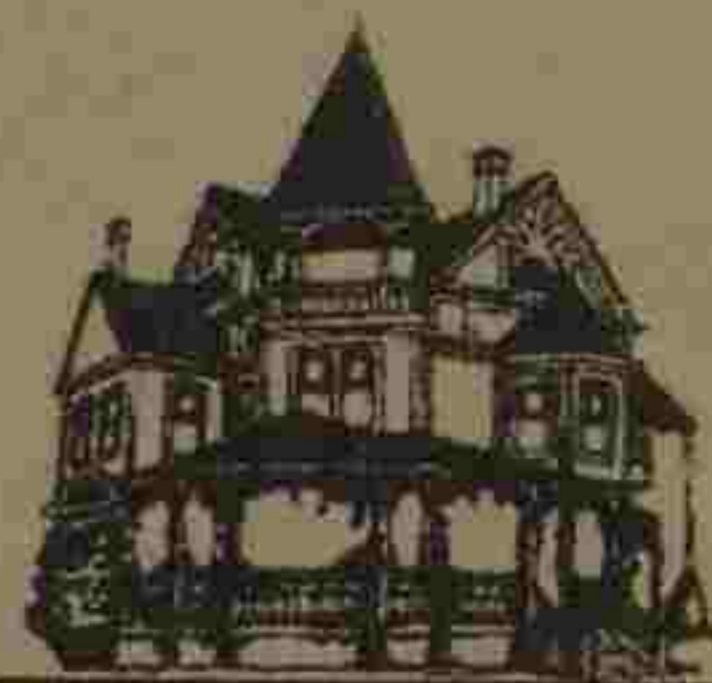
Kirkland Heritage Society