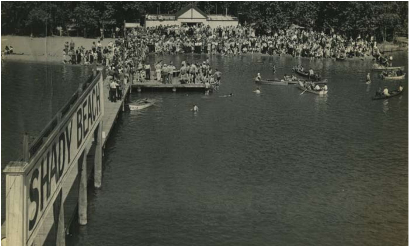
Rare c1940 picture of Shady Beach, located just west of Juanita Beach. Now the site of Juanita Beach

Blackberry Preserves is produced by the Kirkland Heritage Society , for KHS members and those interested in Kirkland's past. Loita Hawkinson, Editor. For information on KHS - visit our website: www.kirklandheritage.org , or call 425 827-3446 to leave a message.