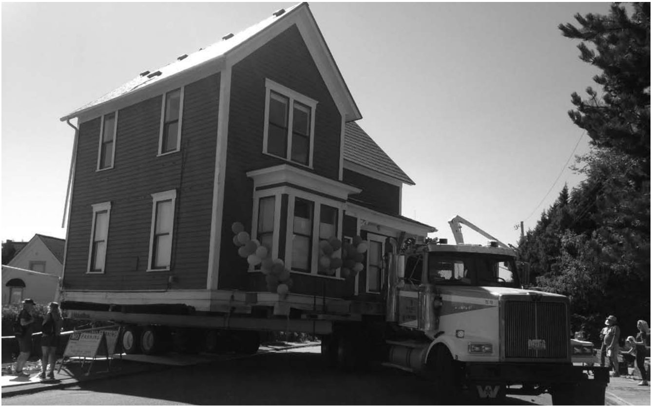
The Buchanan home, Kirkland's first hospital or surgery, during its final move in 2017. See page 6 for invitation.