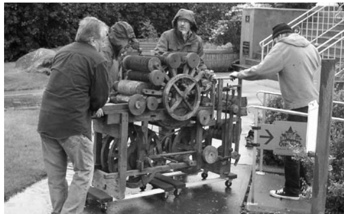
The Nelson carding machine on its way to its new home at the KHS Resource Center