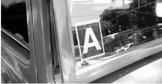
Our Model A Coupe in 1943

We see these letter stickers on the windshields of classic cars from time to time. At one time there was a letter sticker on almost every car manufactured before 1946.