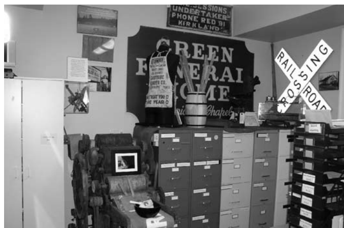
The carder won the battle of the wills and its new home is on the floor where it will be safer and will not fall during an earthquake. The planned display area is quickly filling up with more memories.