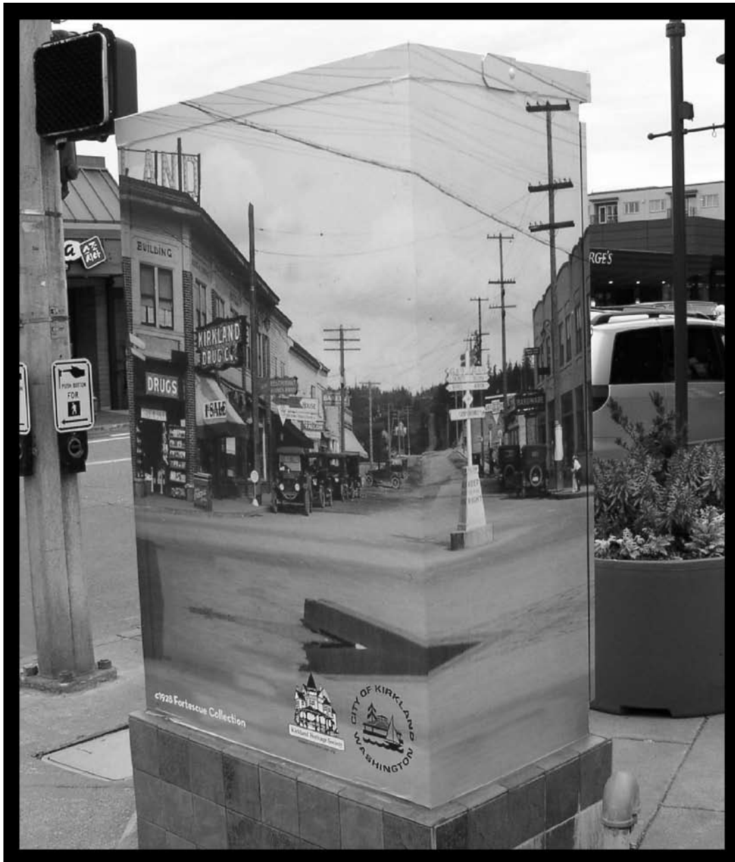
One of the two newly covered Utility Boxes on Lake Street in Kirkland see page 6