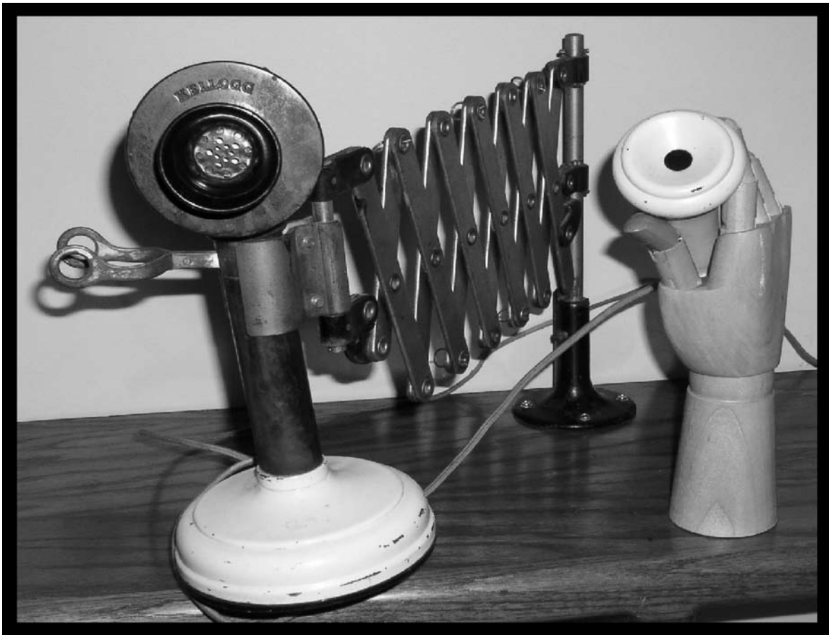
Candlestick telephone and scissor mount. See page 6