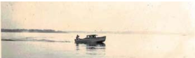
The Roamer on the Lake

Yes, that is my father in the back of the 'Roamer' and my mother is sitting up front on the top of the cabin.