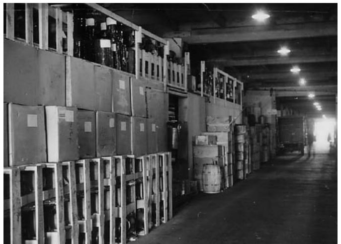
1943, Inside the warehouse.