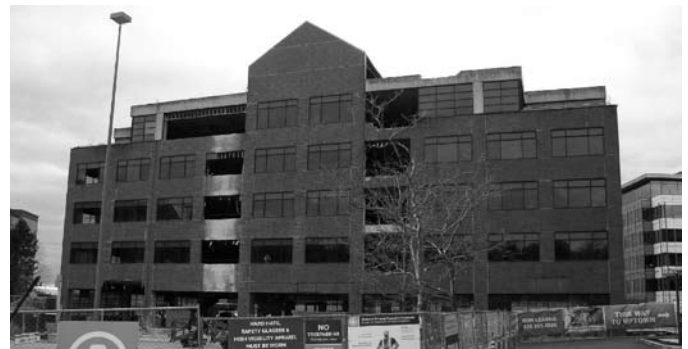
March 3, 2020