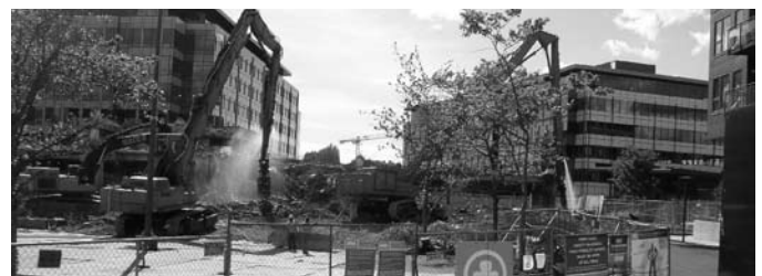
May 11, 2020