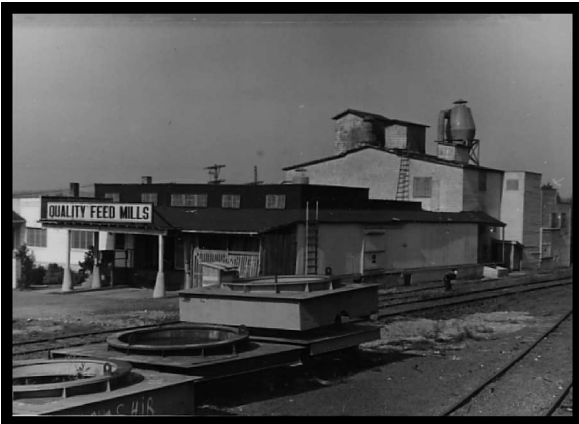
In 1943, the feed mill housed part for the Seaplane Tenders.