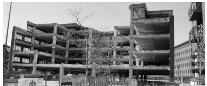
April 13, 2020