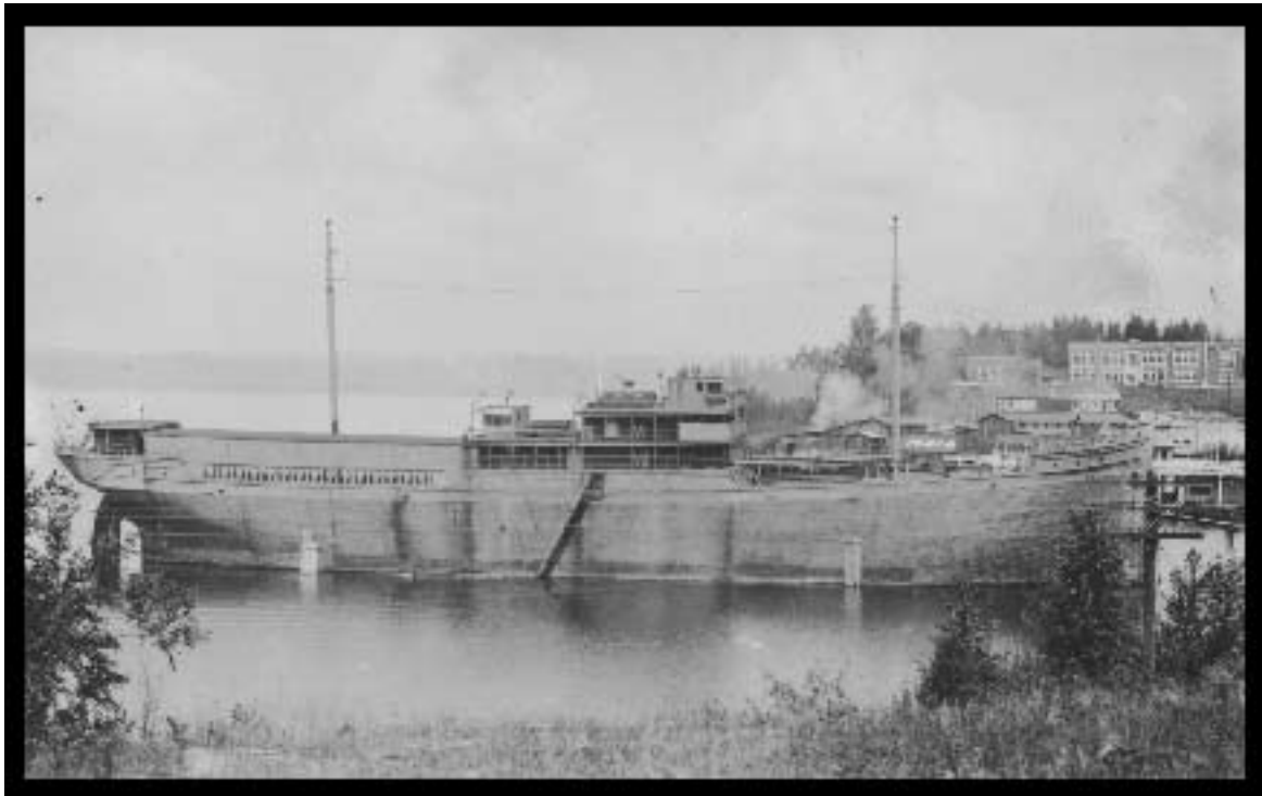
Fort Jackson American Legion clubhouse 1922 - 1929