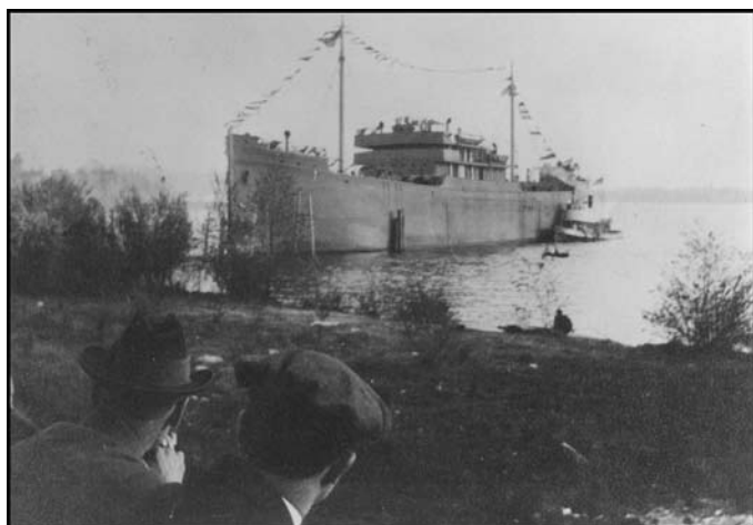
Mr. Fortescue thankfully salvaged the name plate before the ship was towed away.