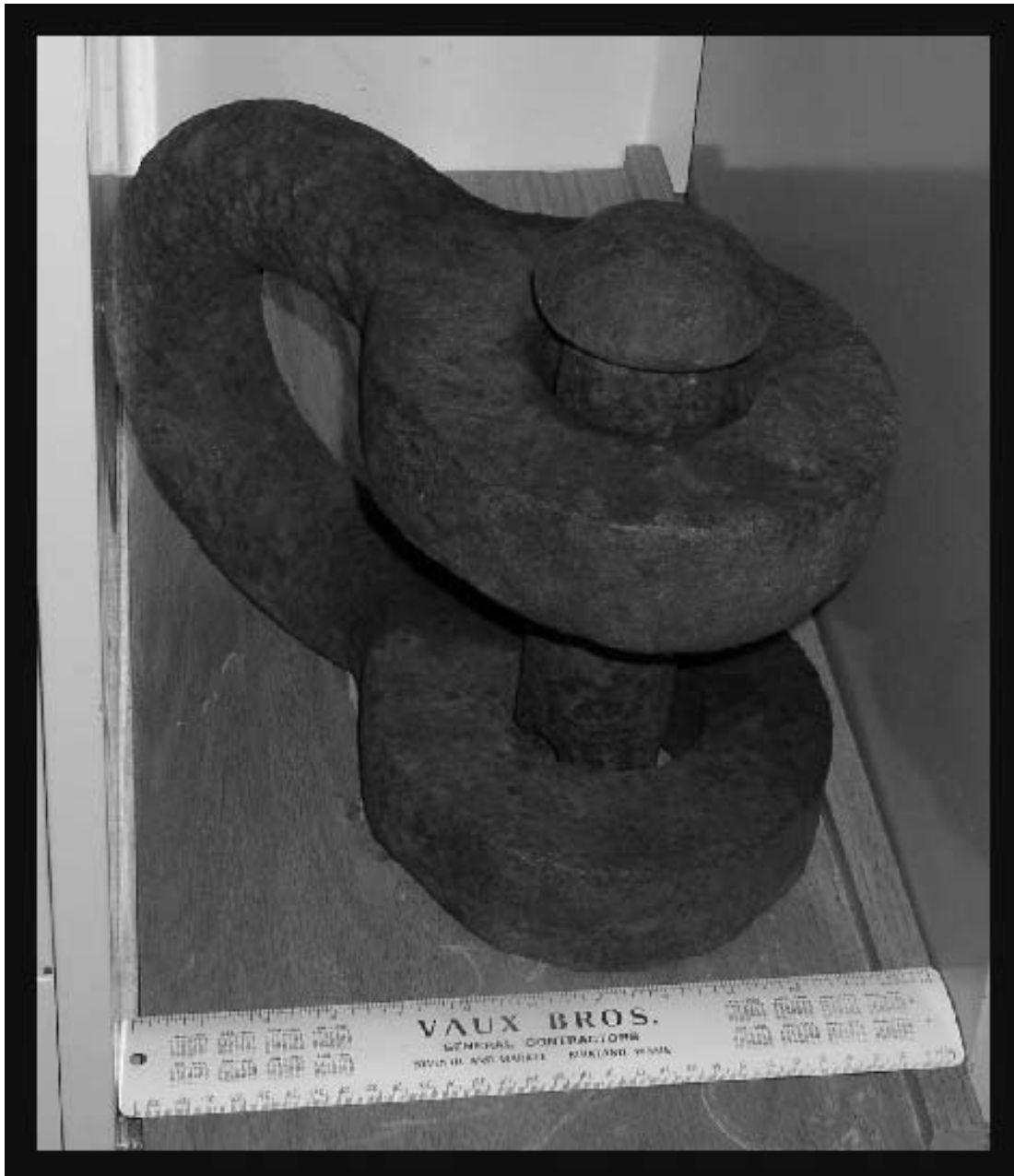
90 pound Anchor shackle from the Fort Jackson Don Schmitz Collection