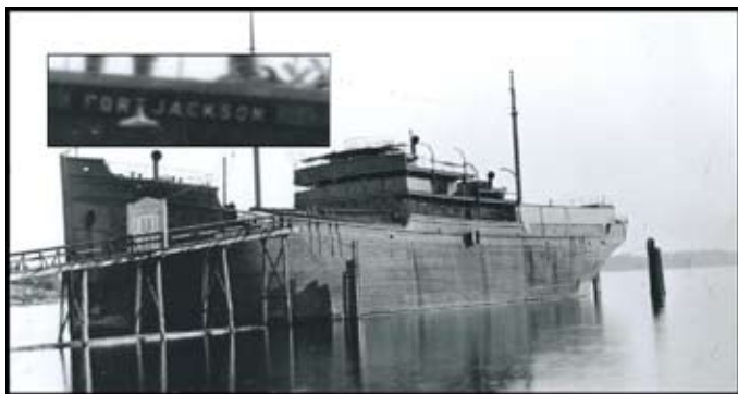
Insert shows the Fort Jackson name plate.