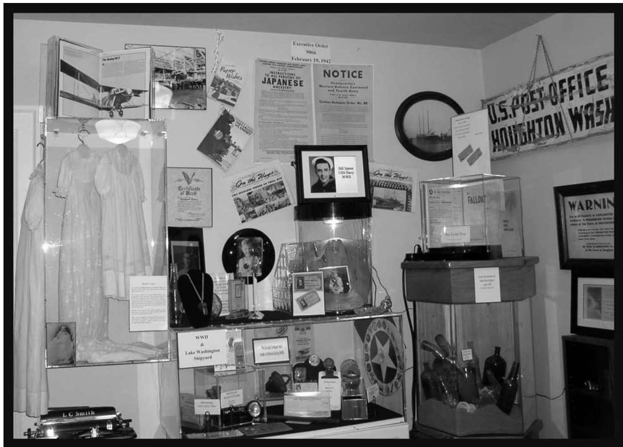
WWII and Lake Washington Shipyard display