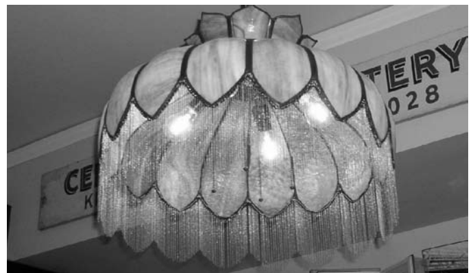
The City of Kirkland Parks Department hung the antique light over the French Family dining room table.