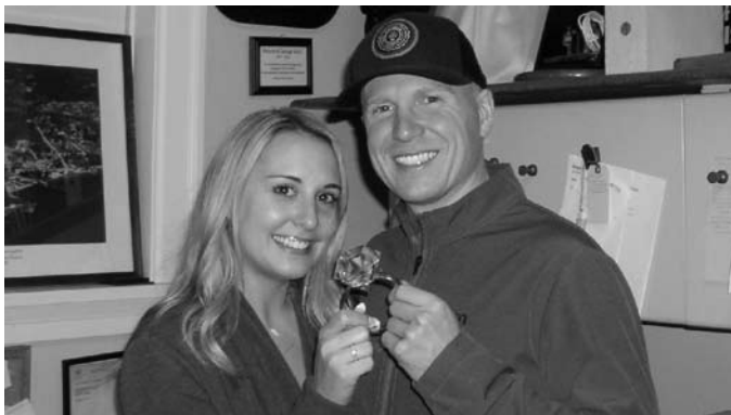
Starting their own family history, this couple chose Kirkland's 2021 Summerfest to celebrate their engagement.