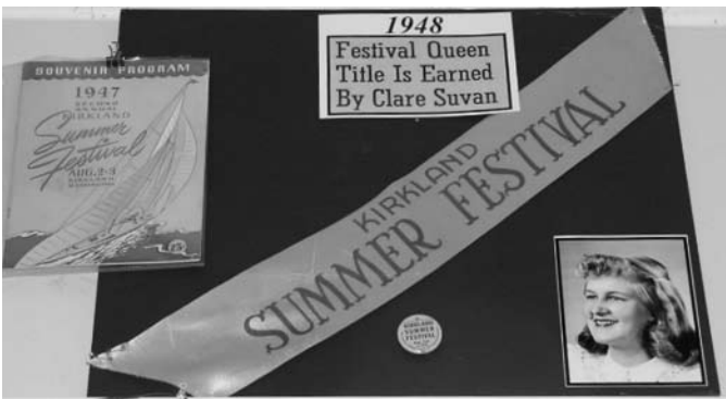
Clare Suvan Lincoln donated her 1948 Festival Sash 2021 Summerfest Volunteers