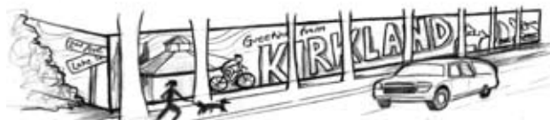
Mural designed by Austin Picinich