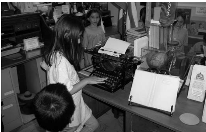
The two typewriters were in constant use and the keys jammed only once.