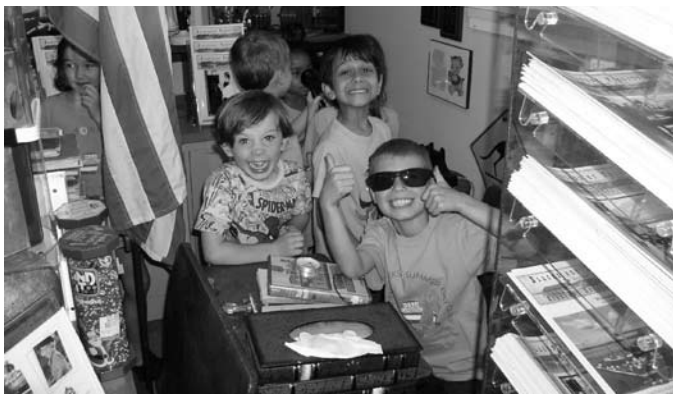
Mugging for the camera while waiting for a turn on the phone.