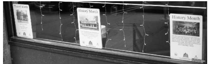
History Month plaques displayed by Kirkland business in February 2025