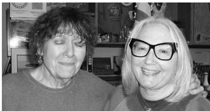
Still Friends in 2025